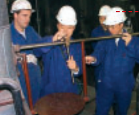
■ Training on pulverised coal measuring module