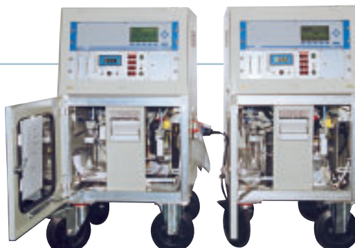
▣ Flue gas analysing modules