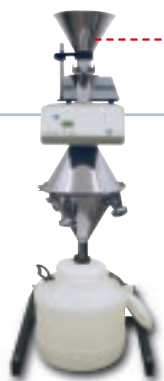
▣ Automatic sample separator

▣ Evaluation module for data acquisition and processing of measured values on the basis of high-precision data acquisition systems and power plant specific evaluation software