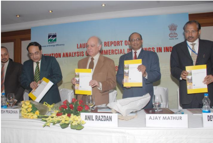
ECBC: Report on "Situation Analysis of Commercial Buildings in India"