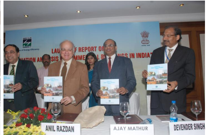
ESCO: Report on "Accredited ESCOs"